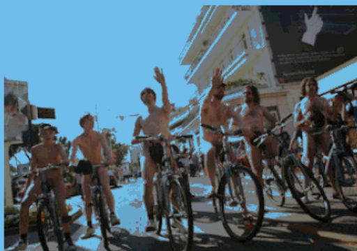
[Enlarge photo]

Crowds hoping to glimpse the stars on the Cannes festival's red carpet got an eye-popping surprise as a team of nude Belgian cyclists paraded down the Riviera seafront.