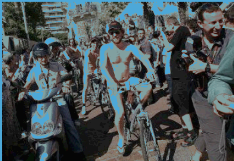
Raw performance ... Actors of The Misfortunates ride naked through Cannes to promote their film.

The comedy, which tells the story of a family of drunkard brothers, seen through a teenager's eyes, premiered on Saturday at the Directors' Fortnight, one of two high-profile sidebars to the main Cannes film festival.